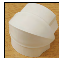
ML-SLG-0012 16mm x 8mm External Bend White