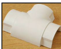
ML-SLG-0008 16mm x 8mm Equal Tee White