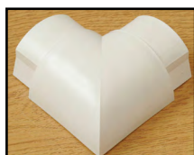
16mm x 8mm Flat Bend White