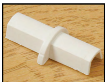
16mm x 8mm Plain Coupler White