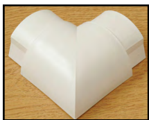
16mm x 8mm Flat Bend White