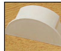
16mm x 8mm End Cap White